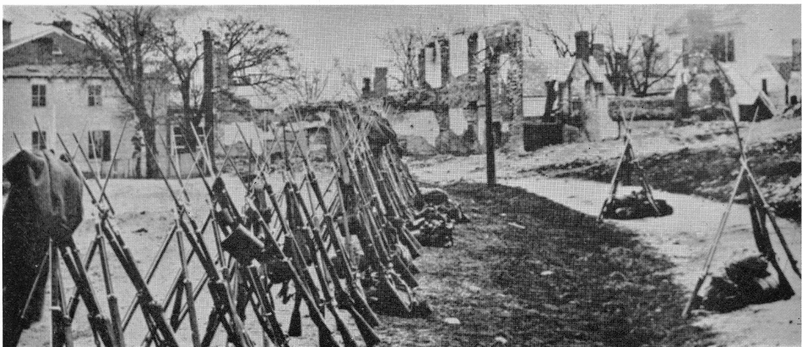
The fighting ends, April, 1865.